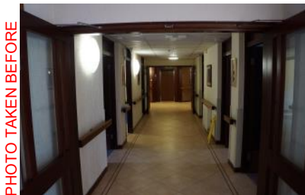
PHOTO TAKEN BEFORE

The scheme has included the provision of new mechanical and electrical services alongside the enlarging of bedroom and en-suite accommodation with the provision of further communal spaces to foster resident inclusivity.