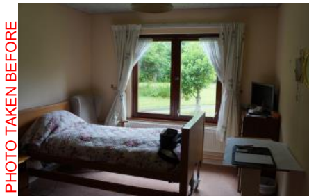
PHOTO TAKEN BEFORE

The scheme has included the provision of new mechanical and electrical services alongside the enlarging of bedroom and en-suite accommodation with the provision of further communal spaces to foster resident inclusivity.