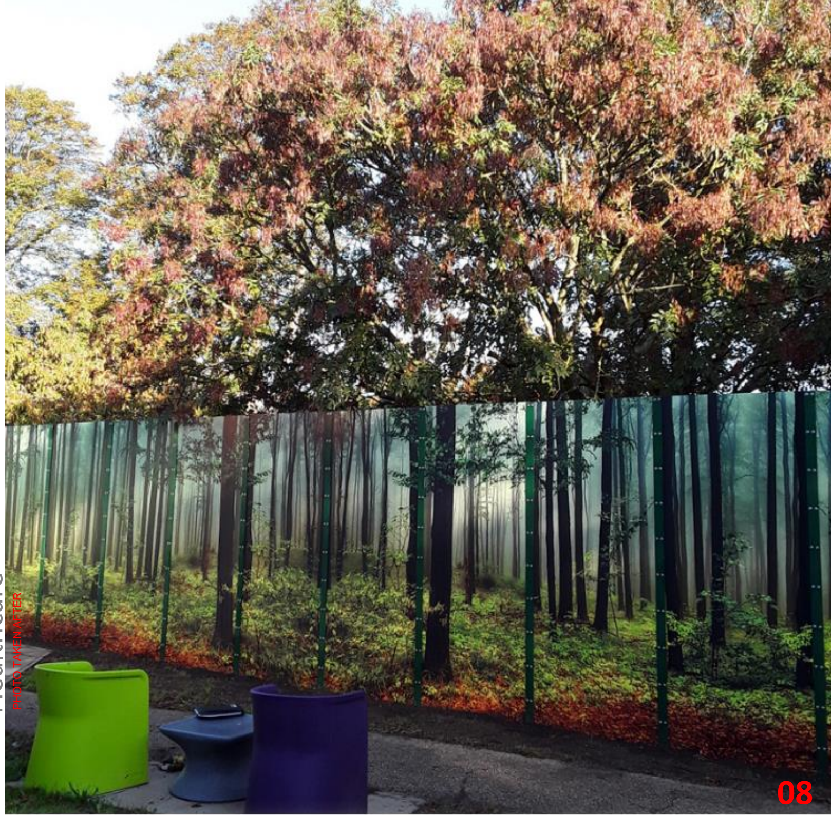
PHOTO TAKEN AFTER