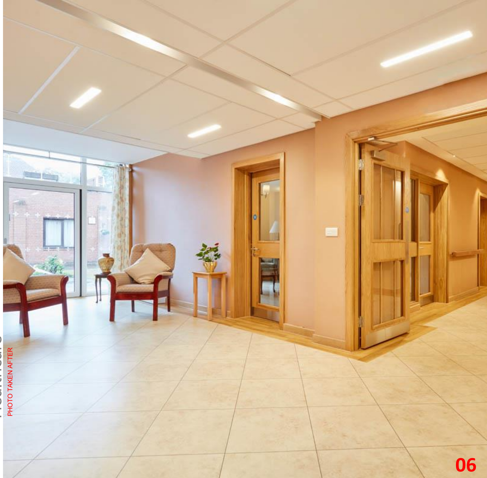
PHOTO TAKEN AFTER