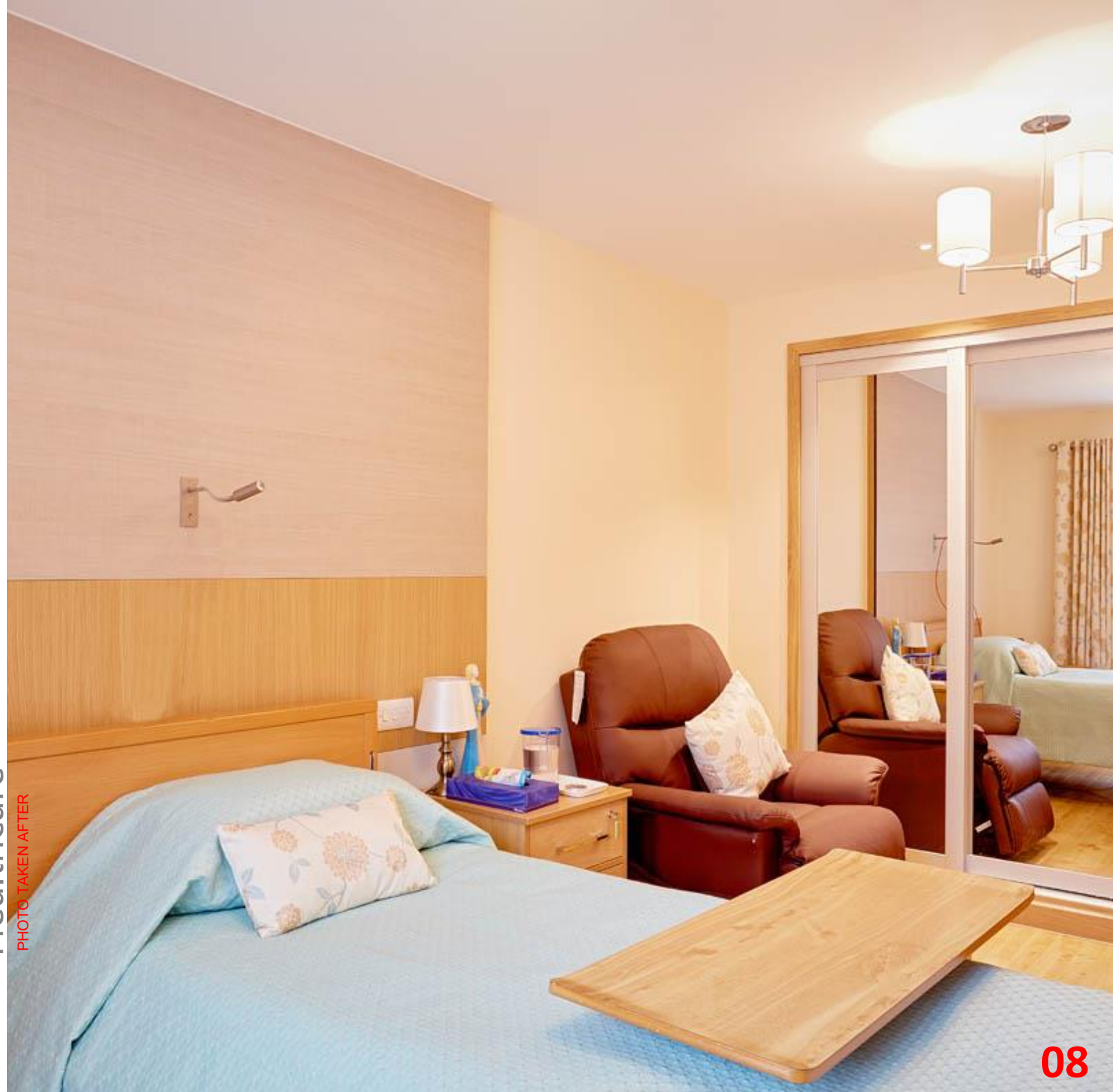
PHOTO TAKEN AFTER